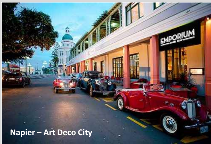
Napier – Art Deco City