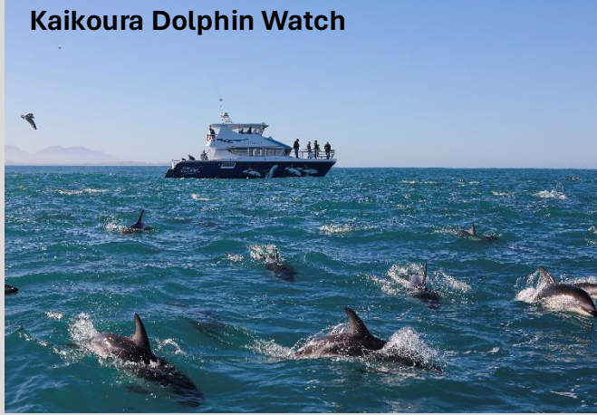
Kaikoura Dolphin Watch

7 nights from NZ$1749 per person share twin