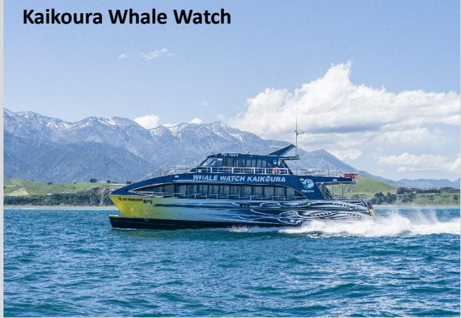
Kaikoura Whale Watch