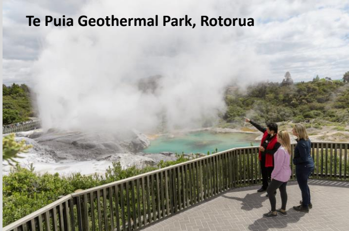
Te Puia Geothermal Park, Rotorua