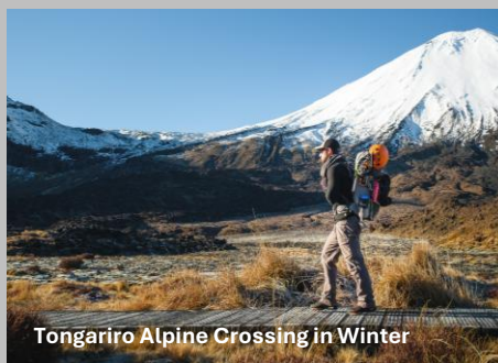
Tongariro Alpine Crossing in Winter