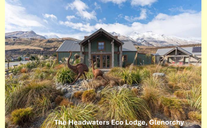
The Headwaters Eco Lodge, Glenorchy

Your stay is at The Headwaters Eco Lodge, Glenorchy in modern rustic-luxe eco accommodation designed in a beautiful rural style